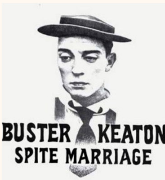
Spite Marriage + Piano February 15