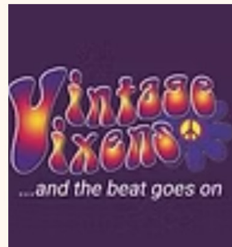
Vintage Vixens March 22

373 N. Church St. Winterville, GA 30683 marigoldauditorium.com