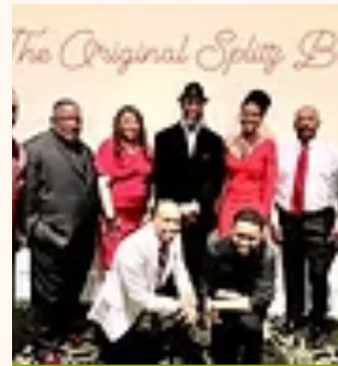
Original Splitz Band February 14