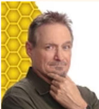
Killer Beaz comedy show January 17