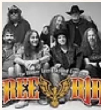
Freebird: Lynryrd Syknyrd Tribute February 22