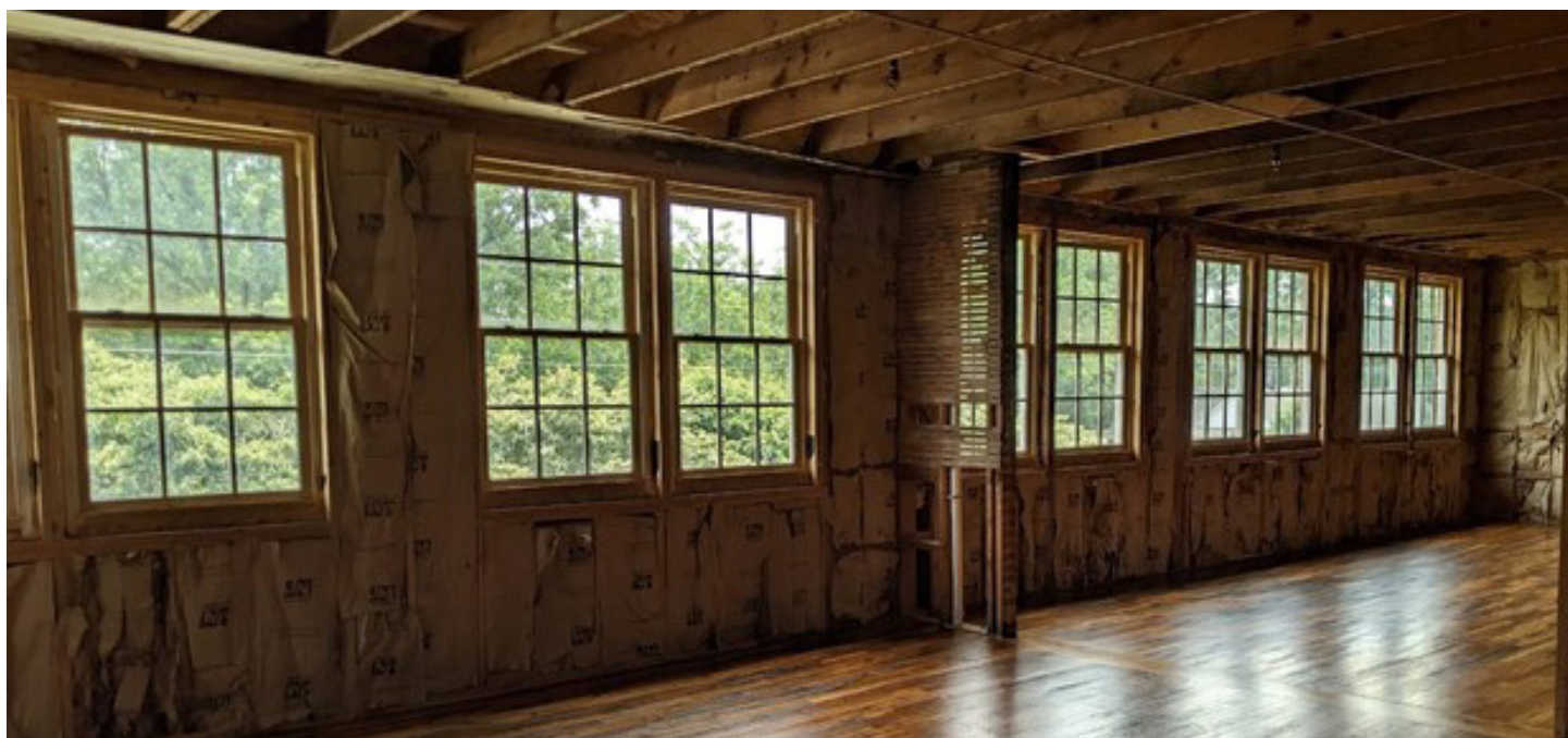
Part of the Winterville Cultural Center (formerly the Winterville High School) currently undergoing renovation and restoration.