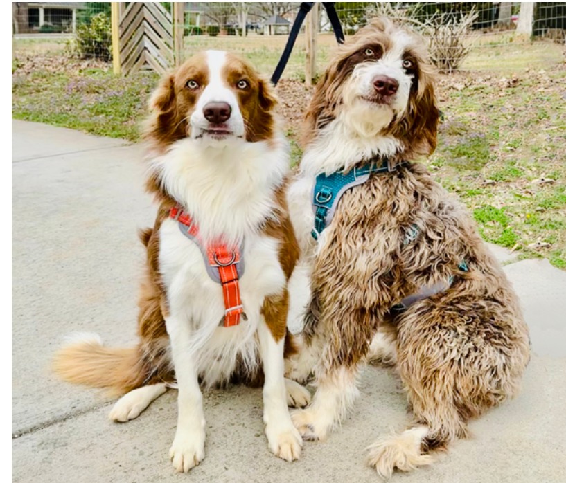
Archer and Charlie 'caught being good' on their leashes in Winterville.

Our Athens Clarke County Commissioners approved the Stormwater Project on Main Street and funded it entirely with ACC's TSPLOST dollars. Winterville benefits from the generosity and understanding of Commissioners who recognize our city and citizens as vital contributors to the greater Athens community. This project includes new pipes, curbs, and gutters along Main Street to address flooding, a safety issue even after moderate storms and rain. This significant initiative will take a little time to complete, so please be patient as we make these necessary improvements.