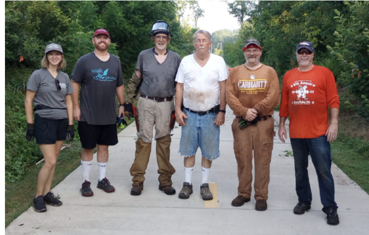
Restoring native plant life on the Firefly Trail.

F riends of the Winterville Firefly Trail Committee created a native plant garden along the section of the Firefly Trail between Adams Alley and the Winterville First Baptist Church. This project is a collaborative effort between the City of Winterville, the UGA Extension Office, the Winterville Tree Commission, the Athens-East Piedmont chapter of the Georgia Native Plant Society, and Butterflies & Blooms in the Briar Patch.