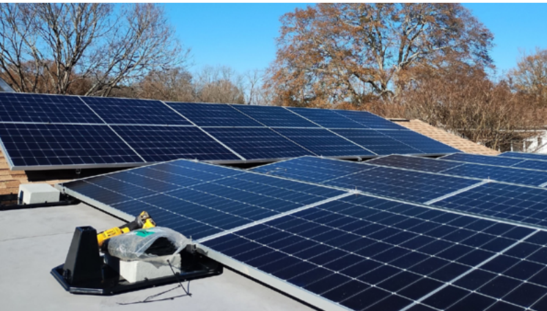
Solar panel install on the Front Porch Bookstore.

For more information, you can follow 100% Winterville on Facebook or email bruceforwinterville@gmail.com .