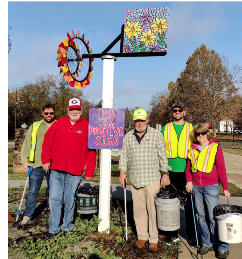
Working to keep Winterville beautiful!