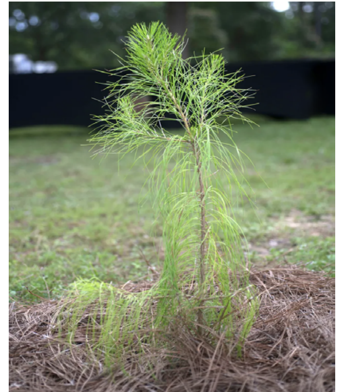
"Artemis I Moon Tree" Loblolly pine seedling.

NASA's Artemis Program sent seeds into lunar orbit aboard the Orion spacecraft as both a nod to the legacy of the Apollo 14 Moon Trees and a celebration of the future of space exploration. The seeds traveled thousands of miles beyond the Moon, spending about four weeks in space