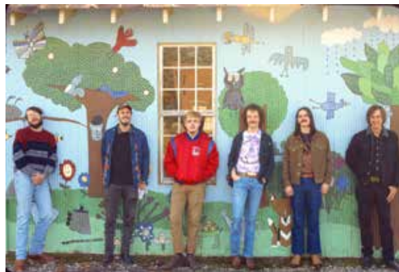
The Pink Stones