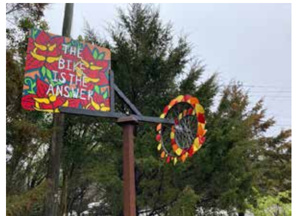
The 'gig at the Jittery Joe's Roastery