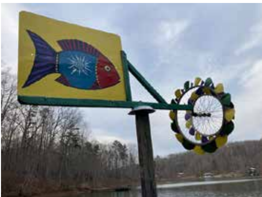
The 'gig at Sandy Creek