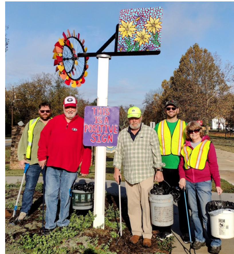
Working to keep Winterville beautiful!