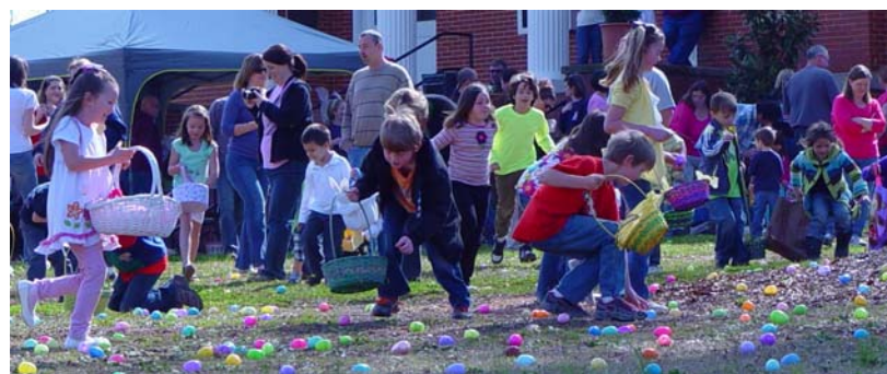
Above: Easter Egg Hunt at the Methodist Church, March 30

Check our website for more details - MarigoldFestival.com